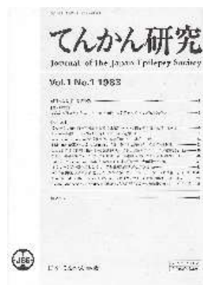
“Journal of the Japan Epilepsy Society”