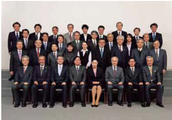
Executive Committee meeting ( Osaka, 2016 )