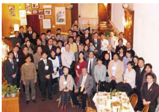
American Epilepsy Society Congress ( Saint Diego, 2011 )