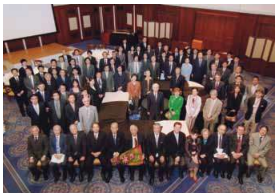
Epilepsy Research- Japan and world ( Tokyo, 2007 )