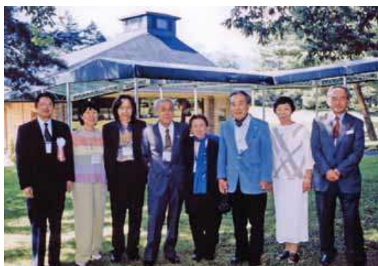
The 4th Asian-Oceanian Epilepsy Society Congress/ The 36th Japan Epilepsy Society Congress ( Karuizawa, 2002 )