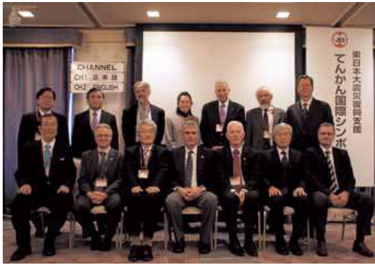
Memorial International Epilepsy Symposium— One year after the East Japan Disaster ( Tokyo, 2012 )