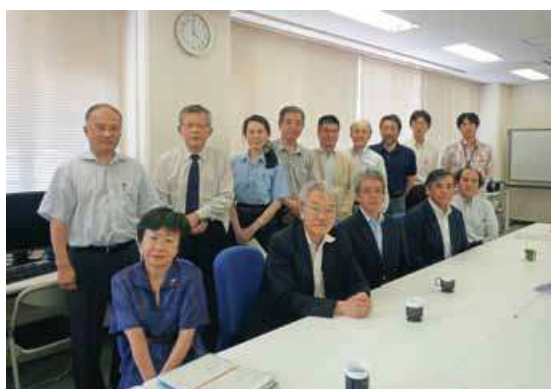
Japan Epilepsy Society Strategic meeting of East Japan Disaster ( Sendai, 2011 )